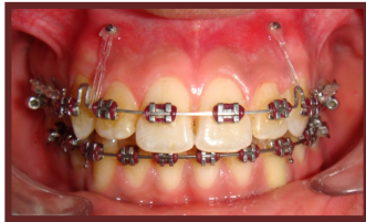
Figure -3: Pre- intrusion

Evaluation of the lateral cephalograms was done at the end of six months and it was observed that rate of intrusion of incisors was found out to be .43 mm / month ( fig 3,4).