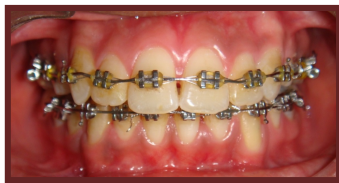
-4: Post- intrusion