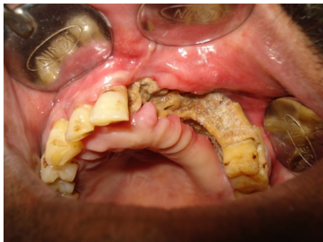
Fig 1: ulcerated lesion on the left maxillary sinus

Intraorally, a single large ulcerated lesion exposing the underlying necrotic alveolus was noticed that was devoid of mucosa and was foul smelling (fig.1). The ulcer extended from 21 to 24 region posteriorly and measured 4x5 cm in size. Based upon the history and clinical examination the case was provisionally diagnosed as nonsuppurative osteomyelitis of the left maxillary alveolus with the differential diagnosis of mucormycosis, wegener's granulomatosis, malignant ulcer and tubercular ulcer.